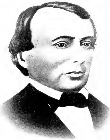
GOV. CHARLES BENT, OF NEW MEXICO